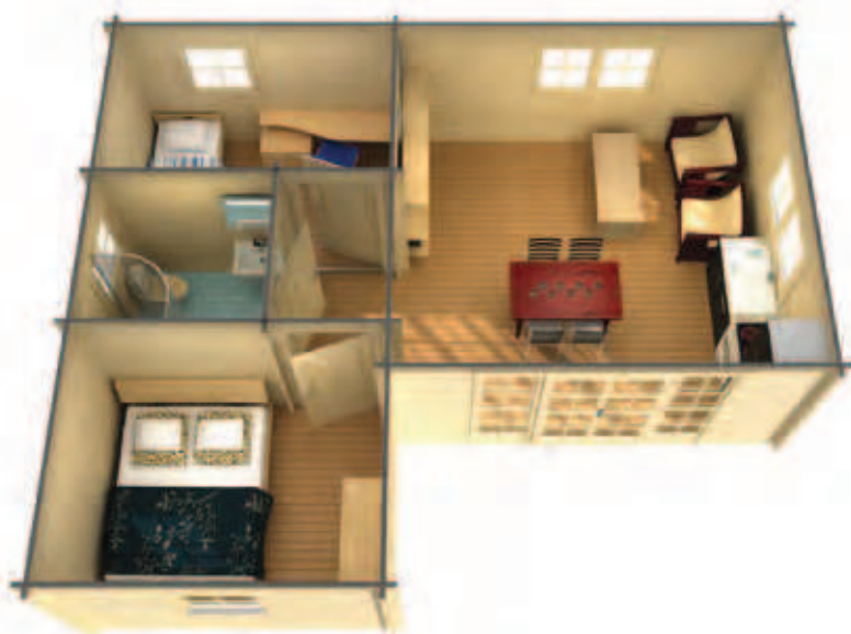
▲ Floor plan of St. Moritz 3