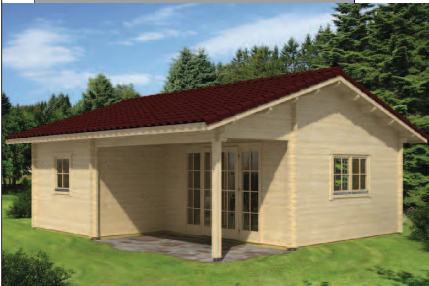
▲ St. Moritz 3 (with insulation kit "tiles" and tiles)